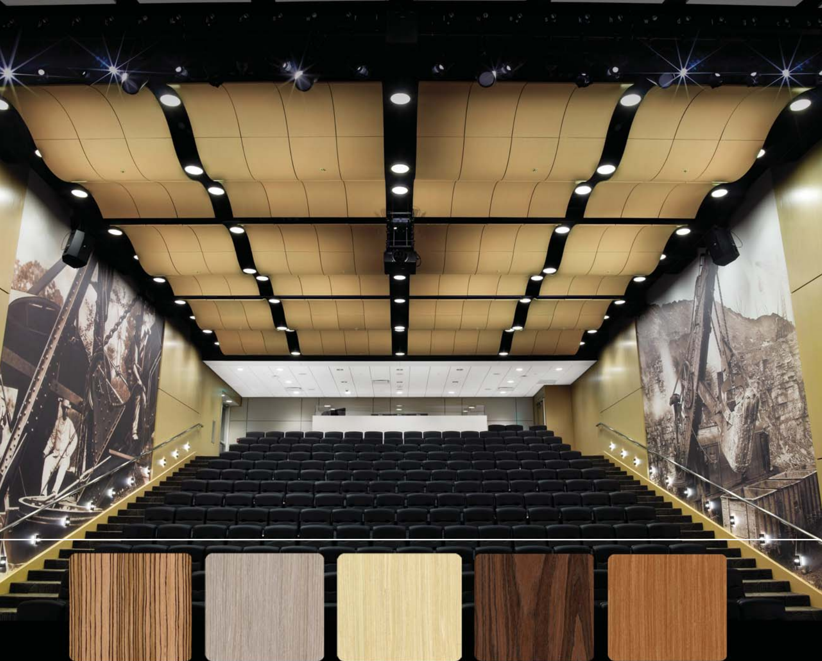
Project: Bucyrus International Inc. Location: Oak Creek, WI. Product: Echo Wood ® Quartered Maple