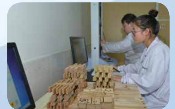
Finished Product Testing and Inspection