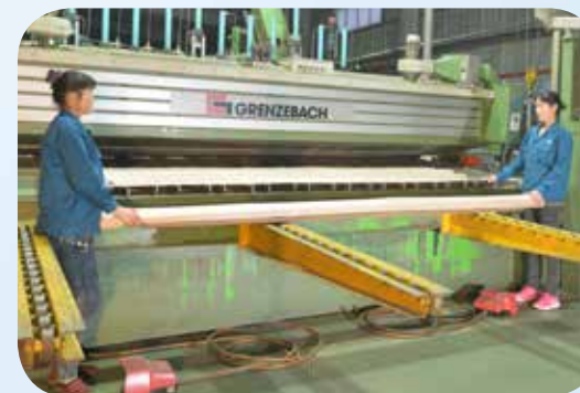
Vertical Veneer Slicing

We ensure our quality requirements are being met at all steps of production. In-factory as well as third party testing ensures consistency in Dragon Ply performance