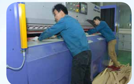
Double Blade Veneer Cutting